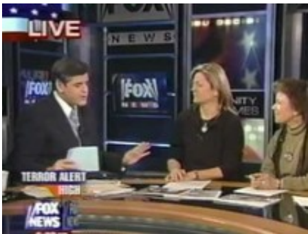
Video: Bordering on Treason trailer