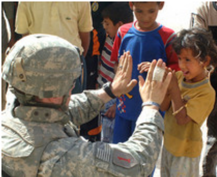
While American soldiers patrolled Baghdad, a New Paltz, N.Y. mom was chronicling the scene up-close.